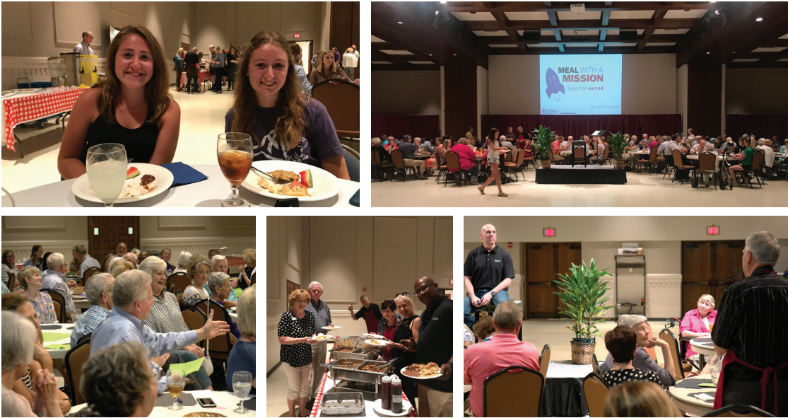
Photos from Meal With A Mission.