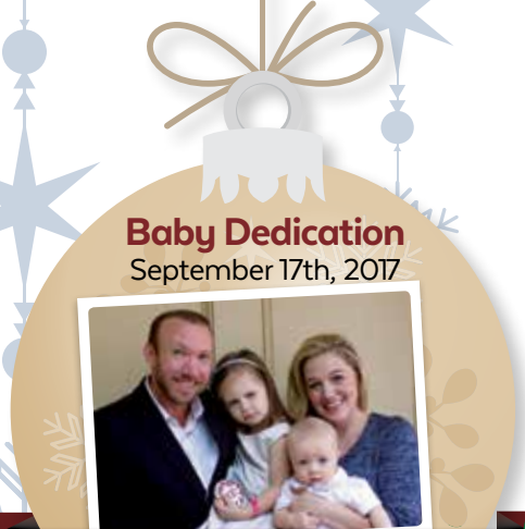
Baby Dedication September 17th, 2017