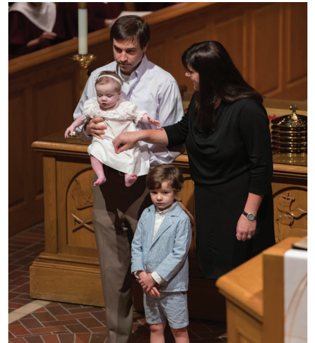
Photos from Finals Feast, Youth Sunday and Baby Dedications.