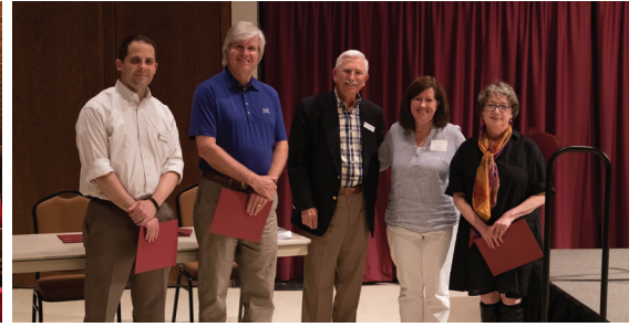
Photos from Youth Sunday, Sunday Worship and Assembly Meeting.

Part of discipleship is responding to the needs of others. From around the world to our local community, we are being called to serve. We offer many outreach opportunities to live out this call.