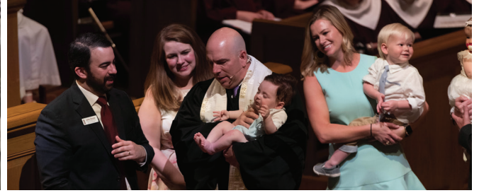
Photos from Youth Sunday and Baby Dedications.

Meaningful fellowship, learning and spiritual development opportunities are available for all seasons of life at UCC. We offer an array of ways for you to grow and connect: Bible studies, book clubs, retreats, workshops and small groups.