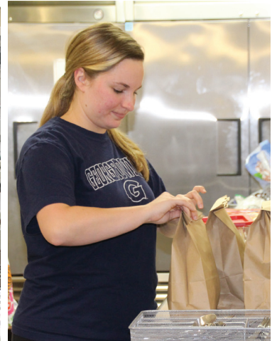
Photos from World Refugee Day and Room In The Inn.

Part of discipleship is responding to the needs of others. From around the world to our local community, we are being called to serve. We offer many outreach opportunities to live out this call.