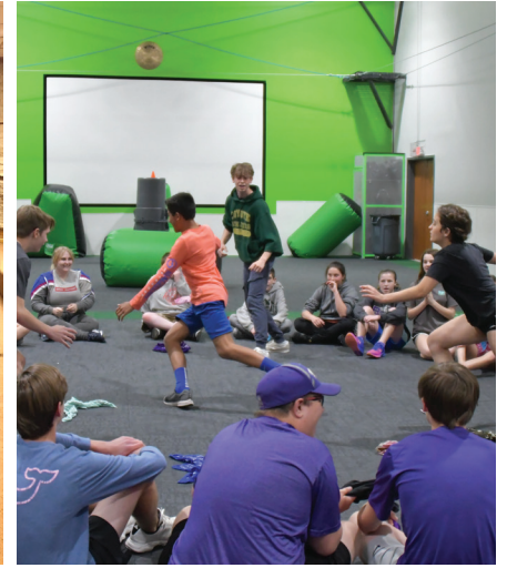
Photos from Men's Gathering, Chi Rho Camp and Youth Lock-in.

Meaningful fellowship, learning and spiritual development opportunities are available for all seasons of life at UCC. We offer an array of ways for you to grow and connect: Bible studies, book clubs, retreats, workshops and small groups.