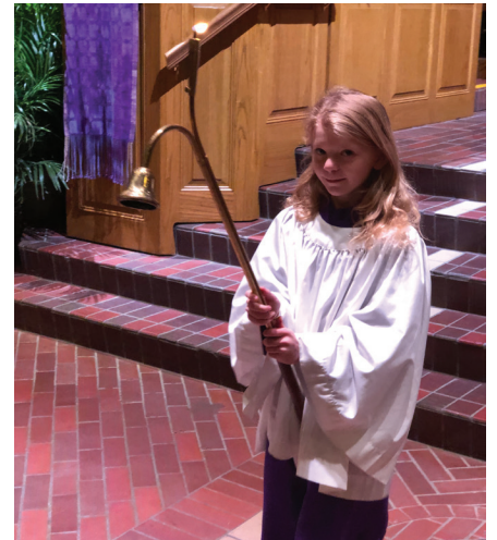
Photos from Connect Lunch, CYF Service Learning Trip, Mens Cookout and Sunday Worship.