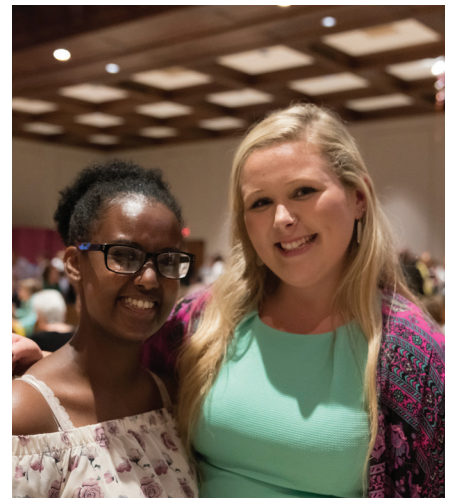
Photos from Room in the Inn and Back to Church 2018.