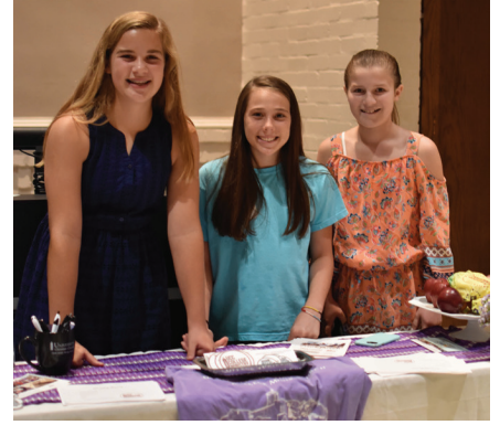
Photos from Back to Church 2018 Sunday.

Meaningful fellowship, learning and spiritual development opportunities are available for all seasons of life at UCC. We offer an array of ways for you to grow and connect: Bible studies, book clubs, retreats, workshops and small groups.