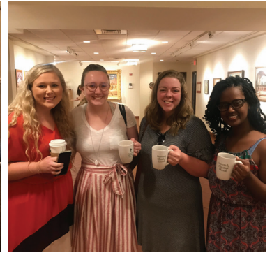
Photos from Chi Rho Camp at Disciples Crossing, Simple Worship and College First Sunday Lunch.

Part of discipleship is responding to the needs of others. From around the world to our local community, we are being called to serve. We offer many outreach opportunities to live out this call.