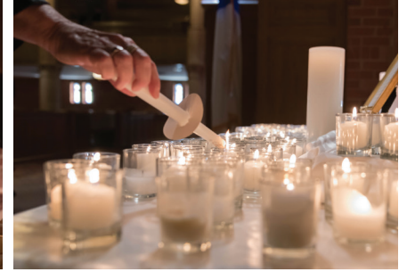
Photos from CYF Fall Retreat, Higher Education Sunday and All Saints Sunday.

Meaningful fellowship, learning and spiritual development opportunities are available for all seasons of life at UCC. We offer an array of ways for you to grow and connect: Bible studies, book clubs, retreats, workshops and small groups.