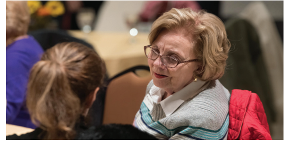
Photos from Thanksgiving Feast and Chi Rho Fall Retreat.

Part of discipleship is responding to the needs of others. From around the world to our local community, we are being called to serve. We offer many outreach opportunities to live out this call.