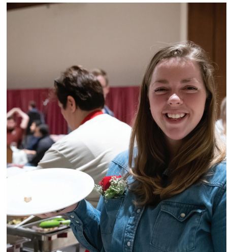
Photos from Higher Education Sunday, CYF Fall Retreat and Thanksgiving Feast.