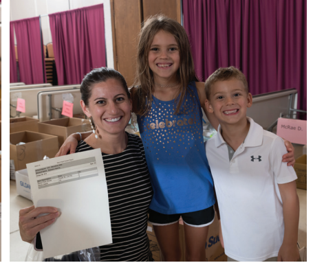
Photos from Bag-It Night 2018.

Meaningful fellowship, learning and spiritual development opportunities are available for all seasons of life at UCC. We offer an array of ways for you to grow and connect: Bible studies, book clubs, retreats, workshops and small groups.